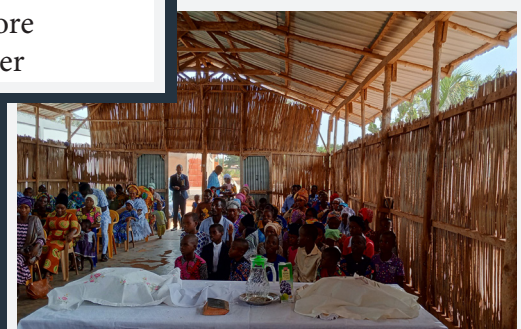
Celebrating the Lord's Supper