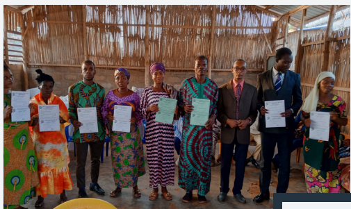
Delivery of baptismal certificates