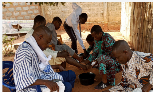
Foot washing before of the Holy Supper