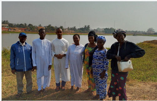
Candidates for Baptism