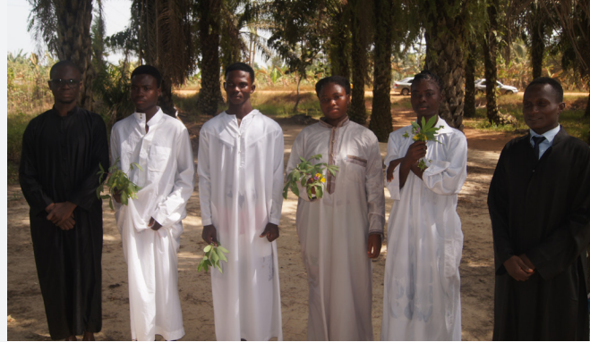
Candidates for Baptism