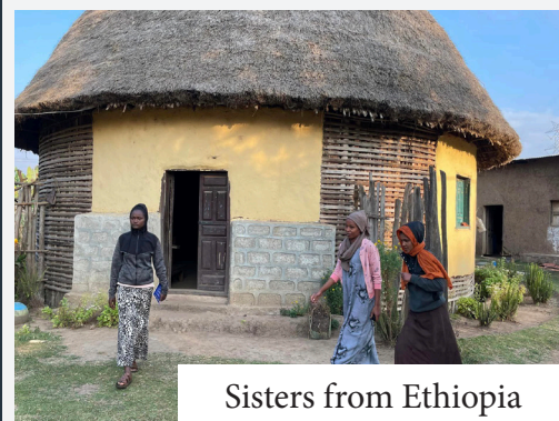
Sisters from Ethiopia