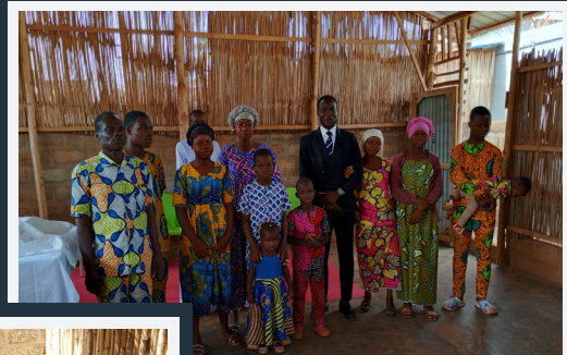
Group of brothers