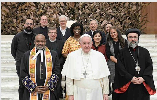
Methodist leaders from different countries and organizations visited Rome and met with Pope Francis. https://www.umnews.org/en/news/Methodist-leaders-visit-rome