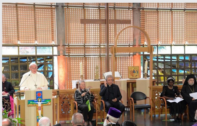
Pope Francis addresses the members of the World Council of Churches (WCC) during his visit to the headquarters of this organization in Geneva. https://www.vidanuevadigital.com/tribuna/el-consejo-mundial-de-iglesias-cumple-hoy-70-anos/