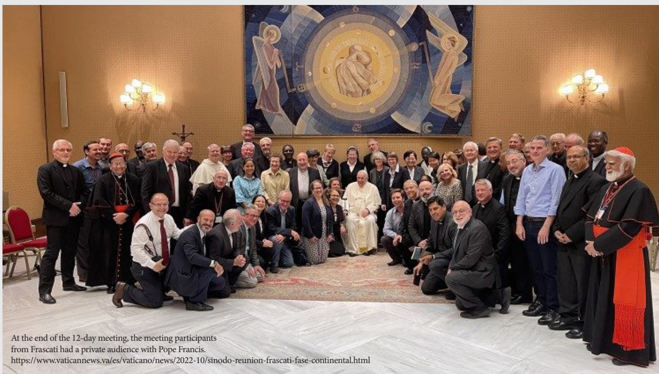
At the end of the 12-day meeting, the meeting participants from Frascati had a private audience with Pope Francis. https://www.vaticannews.va/es/vaticano/news/2022-10/sinodo-reunion-frascati-fase-continental.html