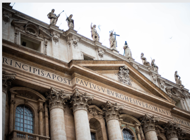
The Basilica of Saint Peter in the Vatican.

All this stands in crass contradiction to the word of God: "Come out of her, My people, that ye be not partakers of her sins, and that ye receive not of her plagues." (Rev. 18:4.)